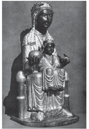
Symbol the "egg" - "The Lightbringer Babylonian High-Mother-Goddess